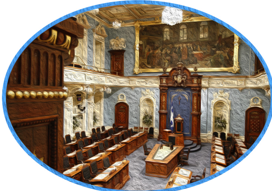
Salle Assemblée nationale Quebec.

In the 1960's the government began to play a greater role at the community level. The Legislative Assembly, the body of government that makes laws, passed a series of laws and/or acts that made life easier, healthier and safer for all Quebecois.