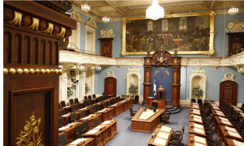
The Legislative Body of Government