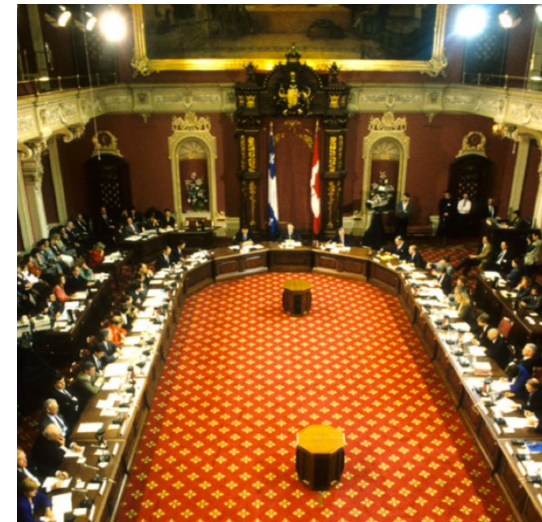
The Red Room during the Bélanger-Campeau Commission