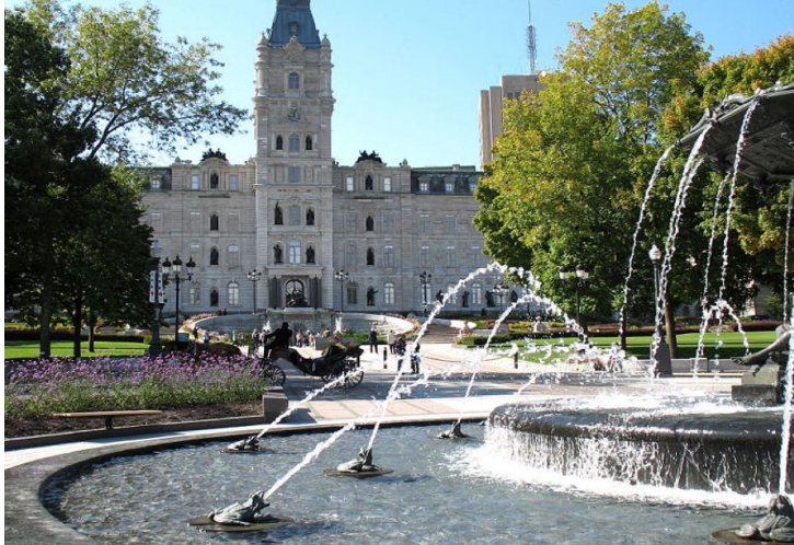
The National Assembly (Legislature) in Quebec City